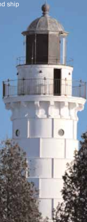
Cana Island Lighthouse - an icon of Lake Michigan nautical history and ship lore

Along Door County's 300 miles of shoreline, numerous lighthouses stand vigil above Green Bay and Lake Michigan, cutting stark silhouettes against a breathtaking expanse of sky that mirrors the azure waters below. Thanks to painters and photographers, the Cana Island Lighthouse is one of Door County's most recognizable landmarks. Built in 1869, the lighthouse remains an active navigational aid. Listen to the sound of the waves. Hear the call of the seagulls. Climb the steps of this 140-year-old lighthouse. Experience unrivaled splendor and the thrill of the view. The keepers' house, the oil house, and the tower are open to the public seven days a week from May through October. Cana Island is located north of Baileys Harbor, off County Road Q.