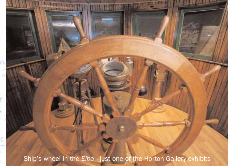
Ship's wheel in the Elba - just one of the Horton Gallery exhibits