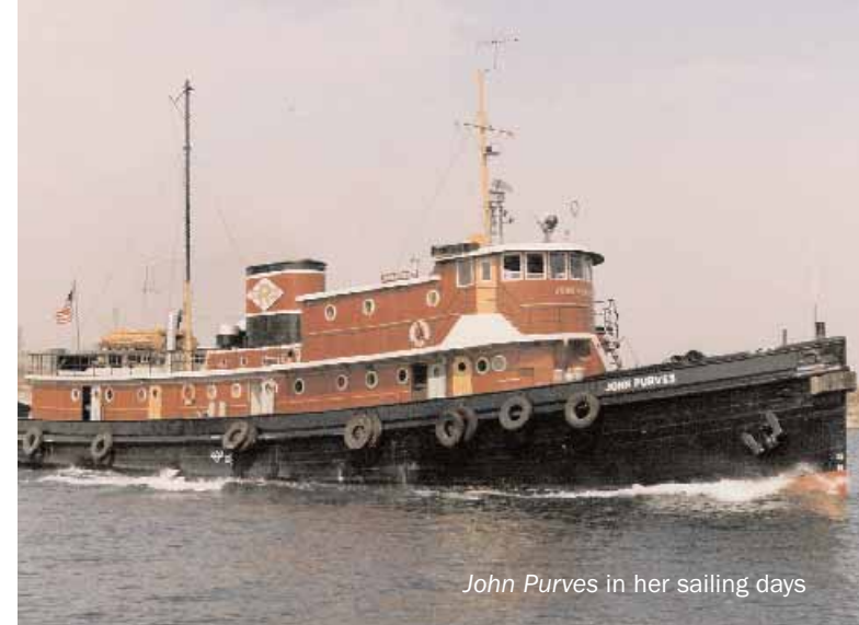
John Purves in her sailing days

The John Purves is authentic and glorious in her details. See the winch room. Explore the engine room and the galley. Tour the cabins. View the waterfront from the pilot house. This vintage 1919 tug has been refinished and restored for your appreciation. Volunteer guides lead guests on a 40-minute tour of the vessel. Located at the Sturgeon Bay waterfront.